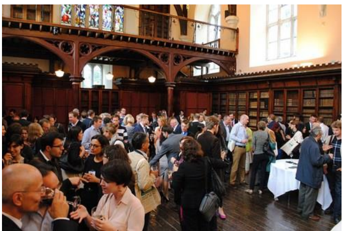
The Aula Maxima was packed for the conference drinks reception.