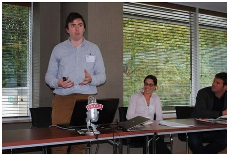
There were some excellent panels and papers during the conference.