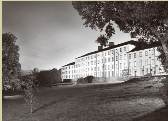
Tipperary University Hospital