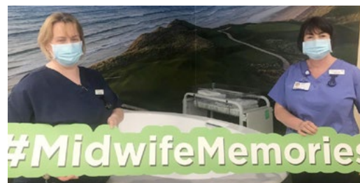
Pictured above: Midwives across Ireland South Women and Infants Directorate share their #MidwifeMemories.