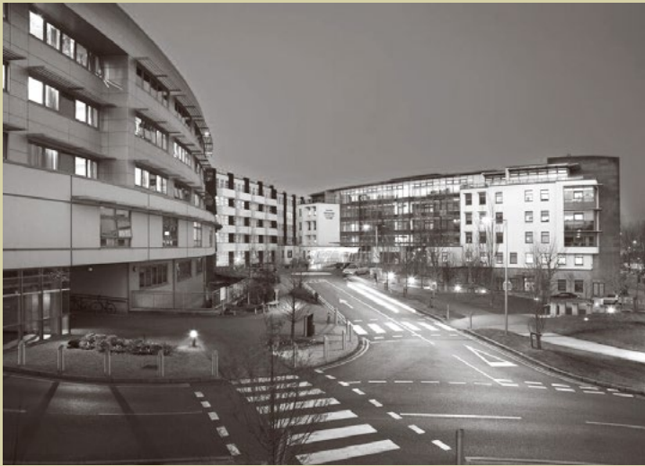
Cork University Maternity Hospital