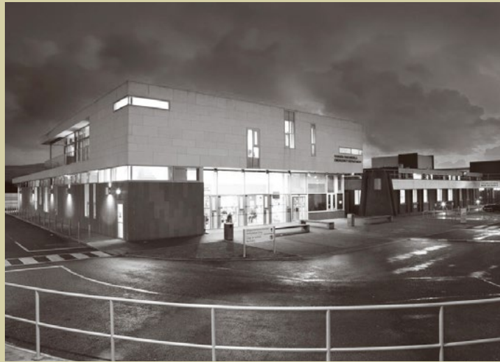
University Hospital Kerry