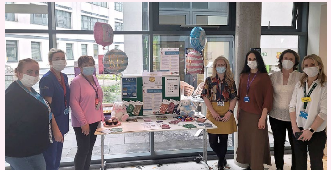
Pictured above: Members of the Specialist Perinatal Mental Health team at CUMH during Maternal Mental Health Awareness Week.