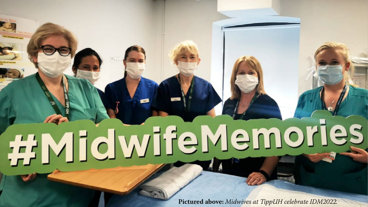
Pictured above: Midwives at TippUH celebrate IDM2022.