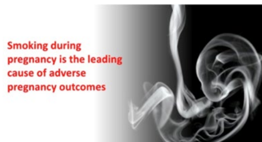
Smoking during pregnancy is the leading cause of adverse pregnancy outcomes

Majella Phelan, A/CMM2 Smoking Cessation, CUMH