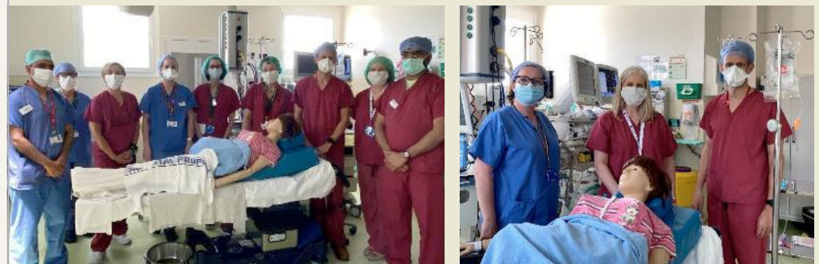
Pictured above: The multidisciplinary team attending the Anaesthetic Emergencies workshop.

The hope is that more regular PROMPT courses can be provided in the future, further promoting good teamwork, early recognition and treatment of emergencies involving the obstetric patient, and hopefully improving outcomes for the mothers and babies of the region.