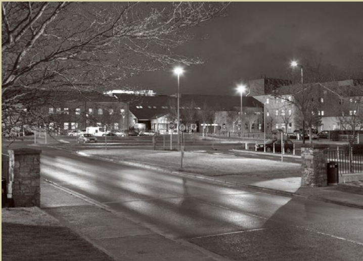
University Hospital Waterford