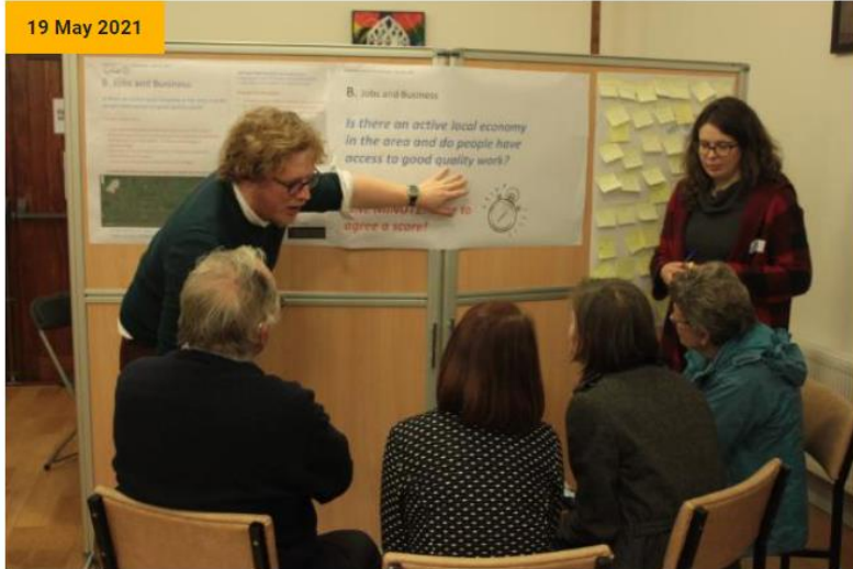
Masters in planning and sustainable students engaging with Glounthaune community Feb 2018.